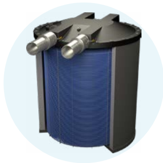
Ice Bank® thermal energy storage