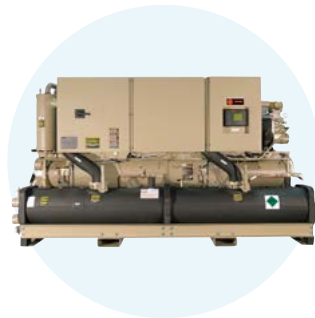
Helical rotary screw model RTWD