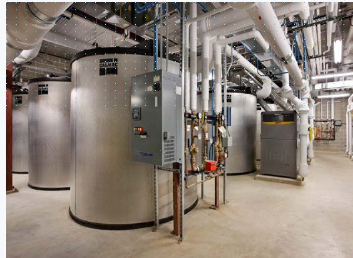
Harness the thermal energy in ice storage tanks

When heat is stored in the ice tanks the ice melts, providing a heat source (two million BTUS) in the form of water. Heat is transferred from the water by a chiller-heater which pumps the heat up to usable level to heat the building. As the heat is removed from the water, the water changes back to ice and the process repeats, allowing you to heat or cool, or both. An air-to-water heat pump provides thermal balancing, by rejecting excess heat in the summer and adding heat in the winter. Building controls complete the system for a reliable, efficient, space optimized system.