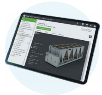
Tracer® SC+ building automation system

As more renewables are added to the grid, emissions in the electric power sector will continue to go down. This means emissions in buildings will go down too, ONLY if you are using electricity to power your building.