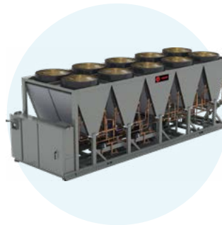
Ascend® model ACX and modular Thermafit™ model ACX