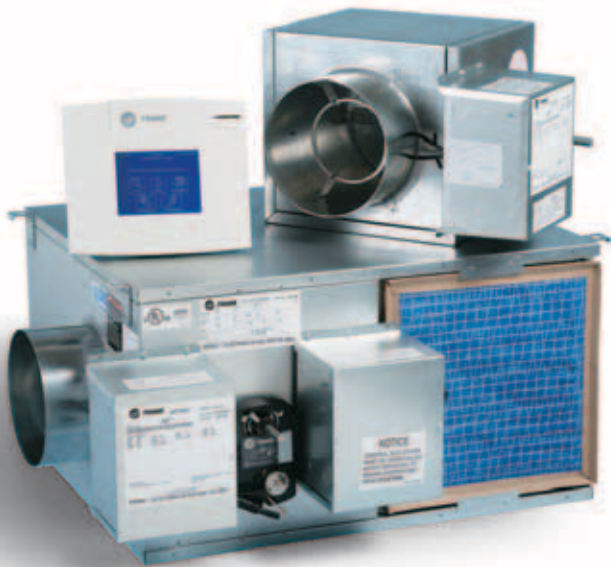
Pictured are the components of a Delivered VAV system: Voyager Commercial VAV Rooftop, VariTrane VAV Terminal Units, and VariTrac Central Control Panel with Operator Display