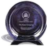
1998 EPA Climate Protection Award