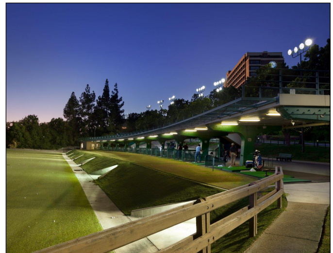
Located on a glorious hilltop near the San Gabriel Valley Mountains, the 650-acre Pacific Palms Resort caters to both business and leisure travelers, with 292 guest rooms and two championship golf courses.

A 500-ton CenTraVac ® centrifugal chiller, equipped with a variable speed drive to lower energy use, replaced one of the