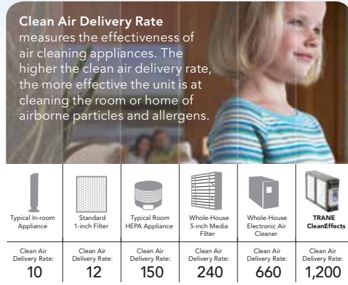
Clean air delivery rate (efficiency times airflow rate) is recognized by the Federal Trade Commission (FTC) and the Environmental Protection Agency (EPA) as a fair and objective measure of various air cleaner technologies. Ratings reflect cubic feet per minute of clean air delivered for a typical 3-ton heating and cooling system: the higher the value, the more effective the air cleaner.

Air that's dirty and full of particulates can not only feel uncomfortable, it can cause breathing problems for family members and exacerbate existing respiratory problems like asthma and allergies. Fortunately, the exclusive .1 micron filtration of an optional Trane CleanEffects removes up to 99.98% of airborne pollutants from heated and cooled air, providing the most technologically advanced air filtration available. That's welcome relief for everyone in your home.