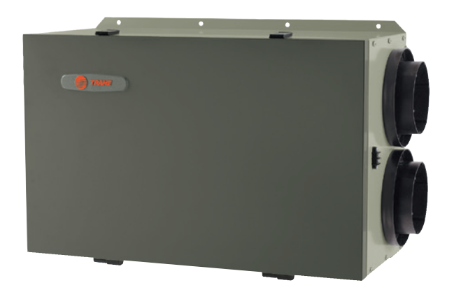
EERVR100, EERVR200, EERVR300

Trane FreshEffects boasts quiet operation and an industry-leading warranty.