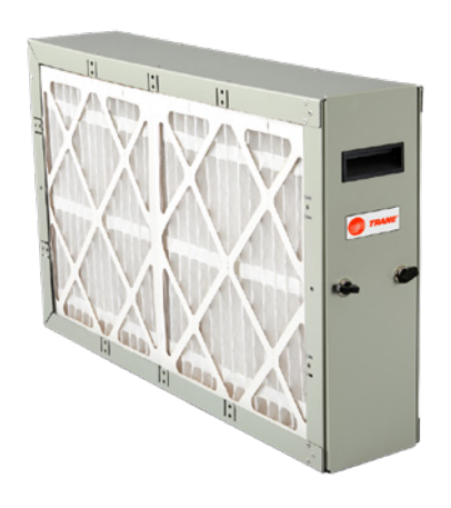
EQBFM17D, EQBFM175, EQBFM185, EQBFM210, EQBFM215, EQBFM235, EQBFM245