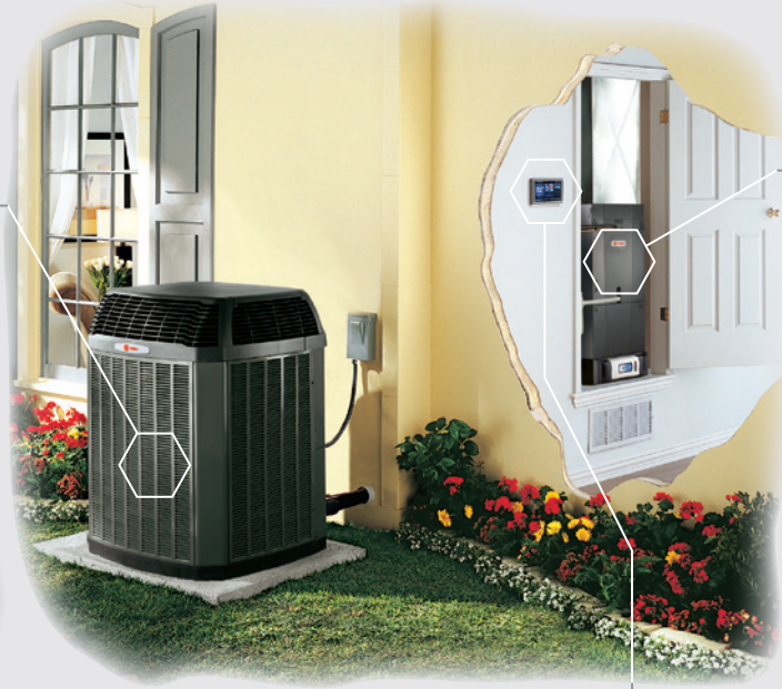
Exclusive Trane Nexia<sup>™</sup>-Enabled Controls help manage your home comfort from wherever you happen to be. They can also easily control over 400 compatible Z-Wave<sup>®</sup> devices like door locks, lighting, garage door openers and window sensors.