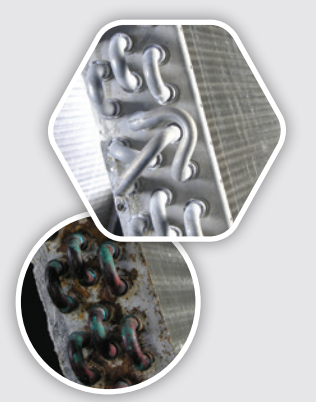
Traditional copper and galvanized steel coils are highly susceptible to corrosion.