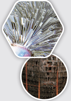
Conventional exposed plate fin stands little chance in harsh environments.