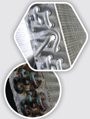
Traditional copper and galvanized steel coils are highly susceptible to corrosion.