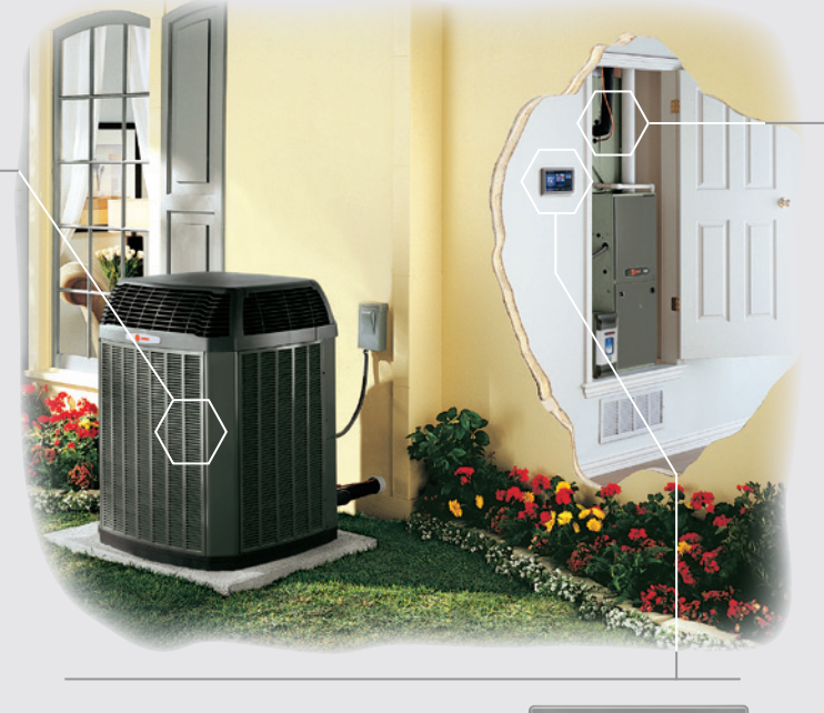
Exclusive Trane Nexia<sup>™</sup>-Enabled Controls help manage your home comfort from wherever you happen to be. They can also easily control over 400 compatible Z-Wave<sup>®</sup> devices like door locks, lighting, garage door openers and window openers.