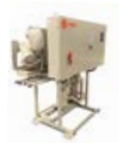
Cold Generator Condenserless Scroll Chillers Model: CCAQ 20 to 70 tons, 60 Hz