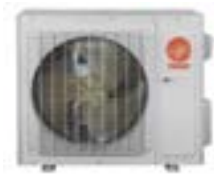
R-Series Models: 4TYK, 4TXK ½ to 3 tons