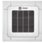
Four-Way Model: 4TVC 9,000 to 54,000 Btu/h