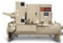
Optimus™ Helical-Rotary Chillers With optional variable-speed drive Model: RTHD 150 to 430 tons, 60 Hz 125 to 430 tons, 50 Hz