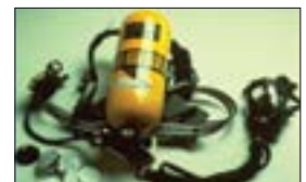
Self-Contained Breathing Apparatus