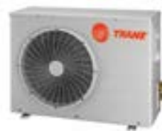
C-Series Model: 4TUK 2 to 2½ tons