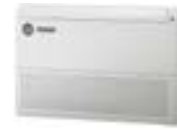
Floor/Ceiling Model: 4TVX 18,000 and 27,000 Btu/h