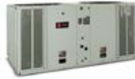
Odyssey™ Three Phase Model: TTA