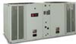
Odyssey Three Phase Model: TWA