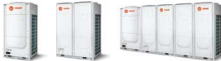
Modular Heat Pump/Heat Recovery Models: 4TVH, 4TVR 6 to 44 tons