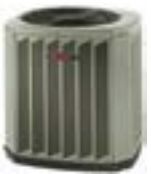
Single Phase Models: 2TWB3, 4TWB3, 4TWR3, 4TWB4, 4TTR5, 4TWB7