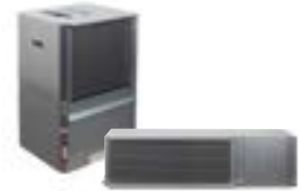
Variable-Speed Model: VSHV 2 to 5 tons