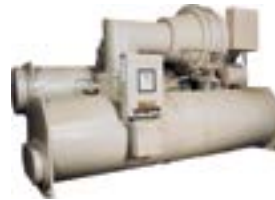
R'newal™ Service Program, Commercial Self-Contained Units, IntelliPak™ Refresh, Centrifugal Chillers, Series R™ Chillers, Adaptive Frequency™ Drives