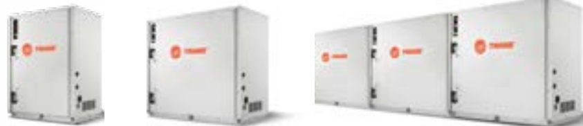
Modular Heat Pump/Heat Recovery Model: 4TVP 6 to 48 tons