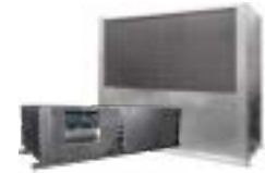
Midrange and Large Model: GEHV 6 to 25 tons