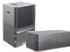
Model: GEHV ½ to 5 tons