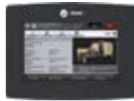
Tracer AdaptiView™ Retrofit Controls for Centrifugal and Water-Cooled Rotary Chillers