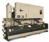
Series R™ Helical-Rotary Chillers Model: RTWD 80 to 250 tons, 50 and 60 Hz