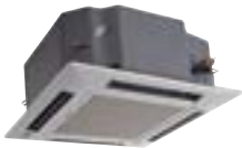
Cassette Model: 4MXC 12,000 to 30,400 Btu/h