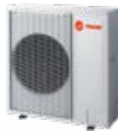
C-Series Model: 4TUK 1½ tons