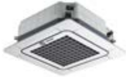
Mini Four-Way Model: 4TVB 9,500 to 23,500 Btu/h