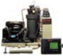
EarthWise™ Purge for R-11, R-123, and R-113 Chillers