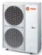
Mini Heat Pump Model: 4TVH 3 to 4½ tons