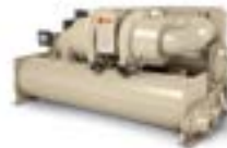
Series S™ CenTraVac Chillers Industrial Oil-Free Model: CVHS 180 to 390 tons, 60 Hz 180 to 340 tons, 50 Hz