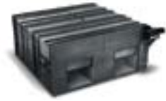
Direct Gas-Fired Indoor Make-Up Air Handler Model: DFIA