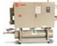
Cold Generator™ Scroll Chillers Model: CGWQ 20 to 70 tons, 60 Hz