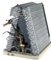
Models: 4CXC, 4TXA, 4TXC, 4TXF