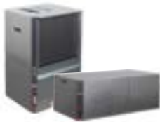
High Efficiency Model: EXHV 1½ to 6 tons