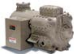
ReSpecT™ Remanufactured Compressor