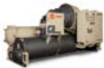
CenTraVac™ Chillers Model: CVHE 120 to 500 tons, 50 and 60 Hz Model: CVHF 325 to 2,000 tons, 60 Hz Model: CVHG 450 to 1,300 tons, 50 Hz