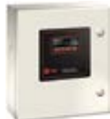
Refrigerant Monitor Model: RMWE