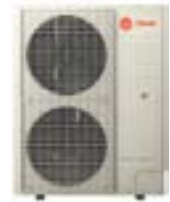
C-Series Model: 4TUK 3 to 4 tons