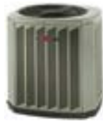
Three Phase Models: 4TTA3, 2TTA3