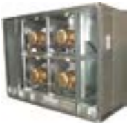
Direct Drive Fan Arrays Model: SDDP 10,000 cfm and up