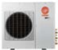
MZ-Series Model: MTXM 1½ to 3½ tons