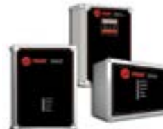
Refrigerant Monitor Model: RMWG