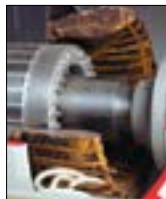
Remanufactured Motors for Centrifugal Chillers