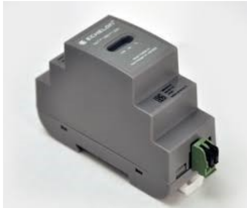
Figure 1. Symbio 700 U60 LonTalk module

Note: The Symbio 700 rotary addresses do not apply to LonTalk communications.