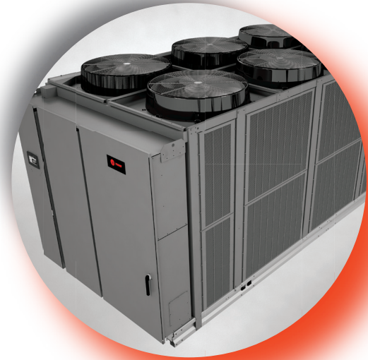
Model ACR 150-450 tons