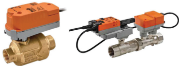
PICV Valve (Otipon)