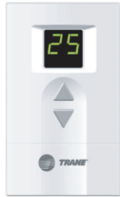
Proportional Thermostat (Option)