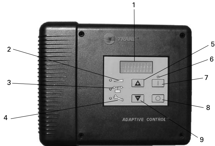
Figure 1 – EasyView Display