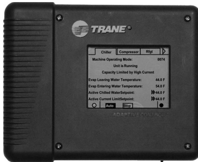
Figure 2 – DynaView Display

Radio buttons show one menu choice among two or more alternatives, all visible. (It is the AUTO button in Figure 2.) The radio-button model mimics the buttons used on old-fashioned radios to select stations. When one is pressed, the one that was previously pressed “pops out” and the new station is selected. In the DynaView model the possible selections are each associated with a button. The selected button is darkened, presented in reverse video to indicate it is the selected choice. The full range of possible choices, as well as the current choice, is always in view.