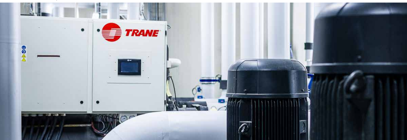
Heat and cold production room

The new Trane Laboratory is resourced to validate the performance of the entire Trane portfolio, including large capacity chillers, air to water heat pumps and multi-pipe units. Temperature extremes from -25^{\circ}\text{C} to +55^{\circ}\text{C} can be simulated, regardless of outdoor ambient conditions.