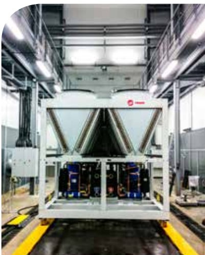
CMAC HE unit on our Charnes (F) laboratory test loop

Schedule an optional witness test in our testing facility in France before the unit ships to the jobsite. Trane’s test facility is capable of evaluating the performance of your Multi-pipe unit - based on customer-defined parameters. Contact your local sales office for more information.