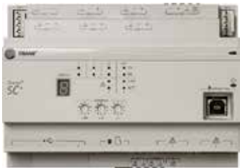
Tracer™ SC System Controller