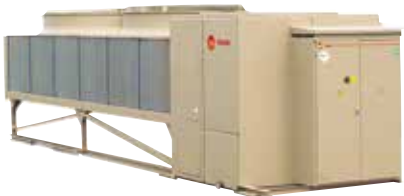
Centrifugal air- or water-cooled chiller: CVAC, CVAD, CVAE, CVGA, CVGD, CVGE, CVGF