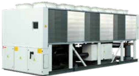
Air-cooled screw chiller: RTAC