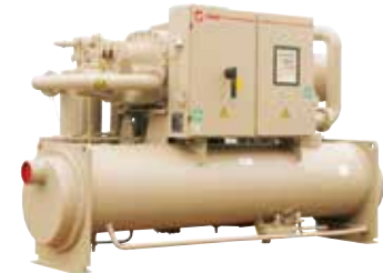
Large water-cooled screw chillers: RTHA, RTHB, RTHC, RTHD