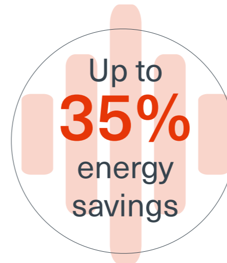
System efficiency improvement