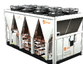
Sintesis™ Advantage chillers and heat pumps CGAF/CXAF