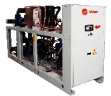
Flex 2 O...and more. Contact your local office.