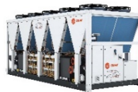
Sintesis™ Balance multi-pipe units CMAF