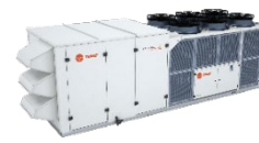
Airfinity™ rooftops IC/IH