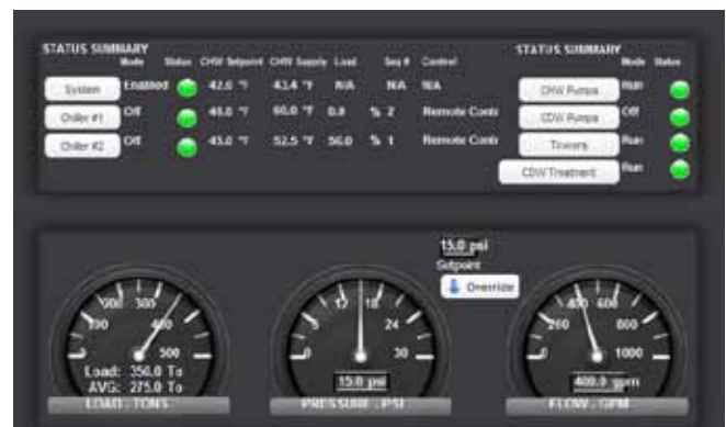
Tracer dashboards use an easy-to-interpret graphical display to report current operating conditions and energy usage.

Adding the Tracer™ SC controller to a system enables you to manage multiple chillers from any location via the Web. Providing proven, configurable applications allows for a host of optimized HVAC systems with a prime example being chiller plant and VAV airside control.