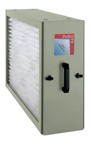
Every Trane Perfect Fit cabinet is built of heavy gauge metal for years of trouble-free use. Two different filtration options are available, including 1" or 5" filter media.