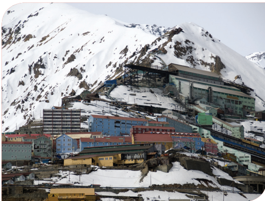
CODELCO (Santiago, Chile)

The RTAC works with low-power thermal storage systems, making ice at night when the utility companies charge less for electricity. The ice tank complements, and can even replace, mechanical cooling during the day when electricity rates are at their highest. In addition, the RTAC can often make ice with the same (or better) efficiency as producing water at 6.5 °C (44 °F) during the day. This is due to lower ambient temperatures during the night, when the ice is made.